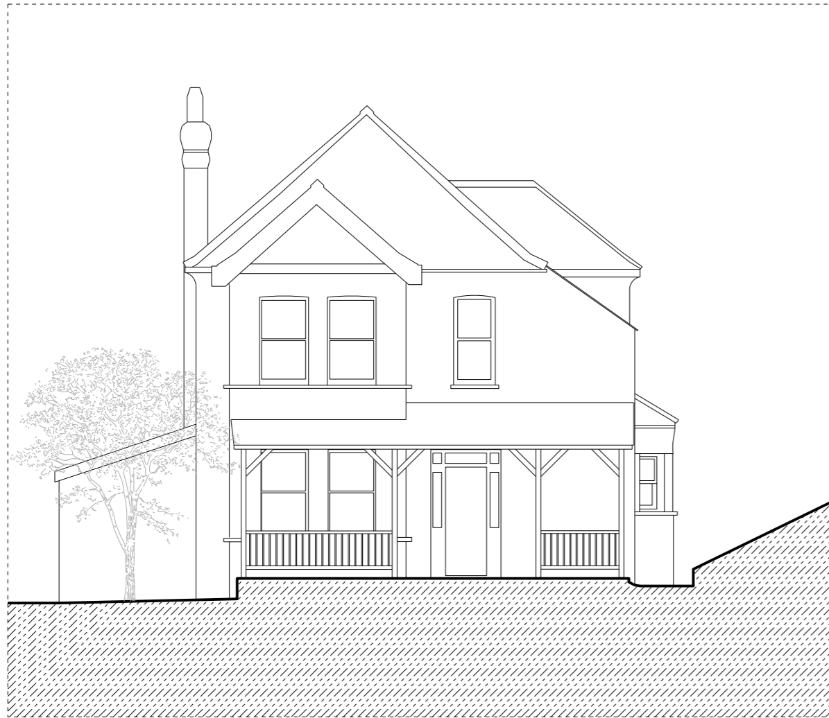
01 EXISTING EAST ELEVATION A1020 1:100 @ A3